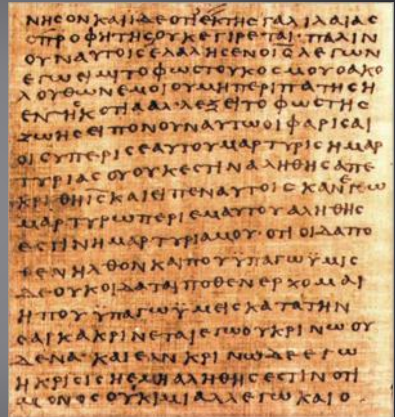
P66 – (200 AD – Egypt)

(There was a man sent from God, his name was John. He came as a witness so that he might testify to the light, so that all might believe through him. That one was not the light, but came to testify concerning the light.)