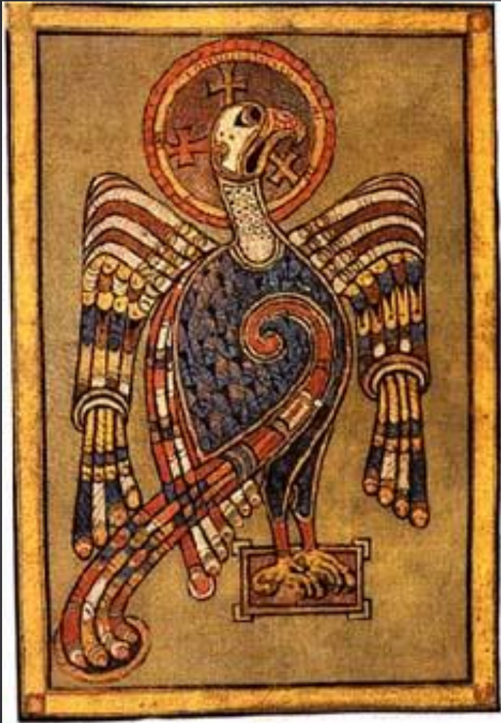
Title Page to John in the Book of Kells (800 AD – Ireland)