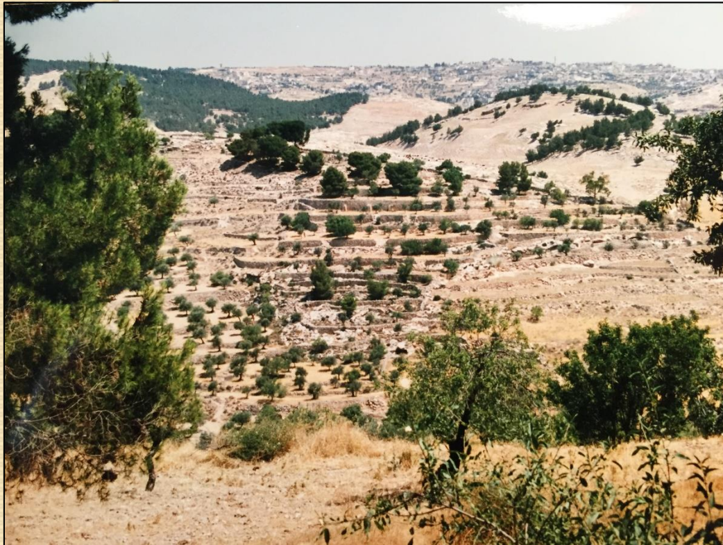
Shepherd's Fields Outside of Bethlehem - 1995

How does Jesus describe this “flock” (v. 16)? Why is that important?