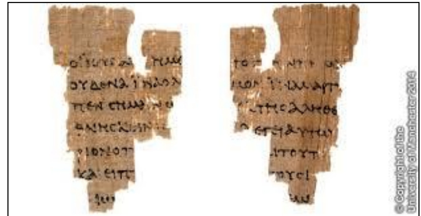
Earliest Biblical Manuscript Papyrus #52 – Part of John 7 & 8 (~125 AD – Egypt)