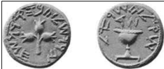
Coins from Reign of Simon Maccabeus (135 BC)

How Were We Led Astray? What Will Happen with the Romans?