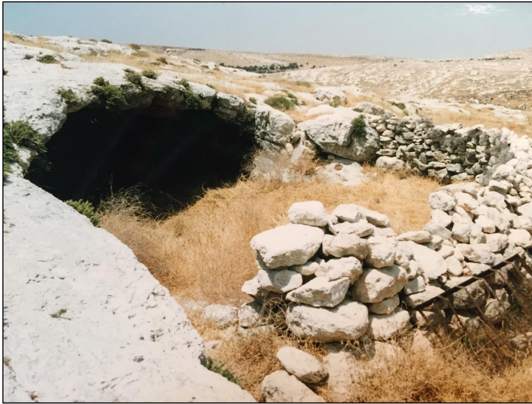
Sheep Pen in Israel - 1995

Why do the sheep know the shepherd’s voice?