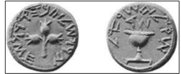
Coins from Reign of Simon Maccabeus (135 BC)