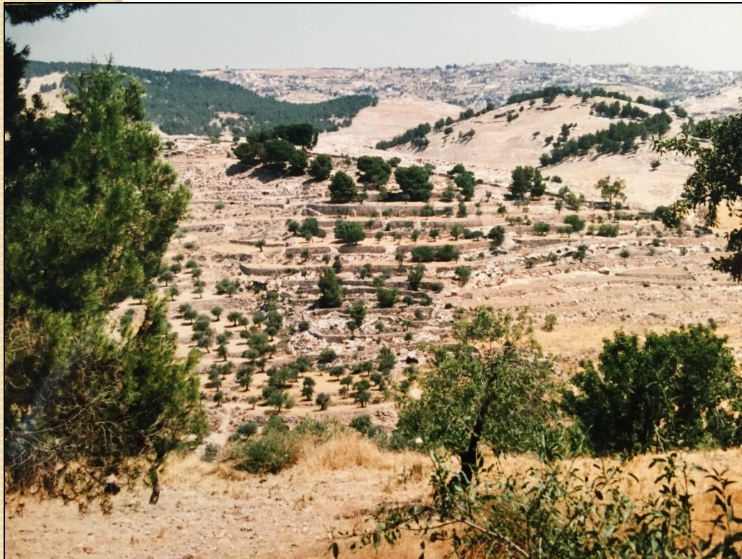
Shepherd's Fields Outside of Bethlehem - 1995

How does Jesus describe this “flock” (v. 16)? Why is that important?