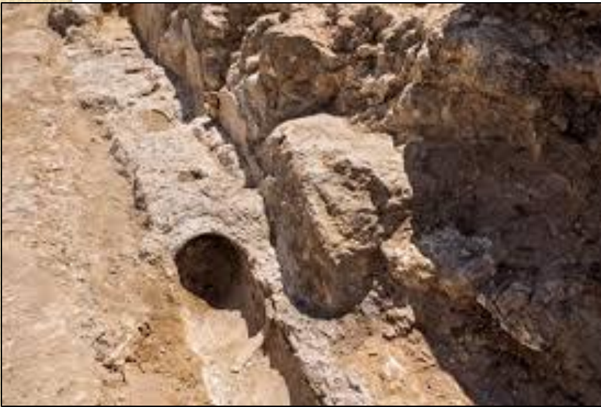
Aqueduct Discovered Last Week in Jerusalem (1 st century AD)